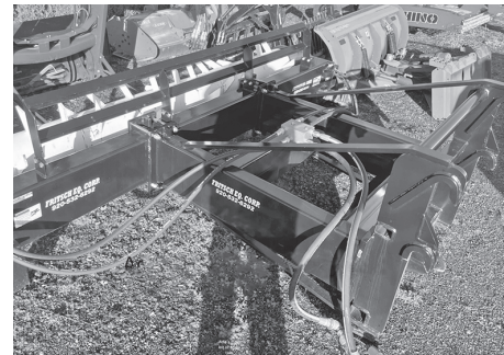
10' Fritsch silage defacer, dual motor, $13,999.